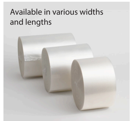
Available in various widths and lengths