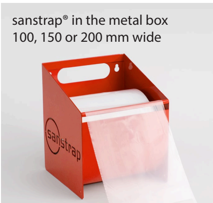
sanstrap® in the metal box 100, 150 or 200 mm wide