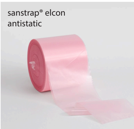
sanstrap® elcon antistatic