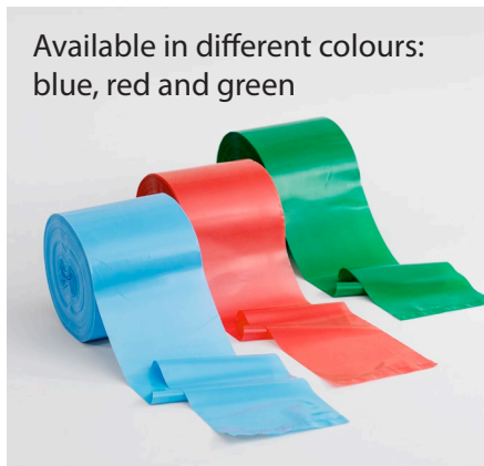
Available in different colours: blue, red and green