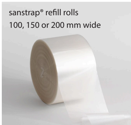
sanstrap® refill rolls 100, 150 or 200 mm wide